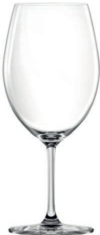
LSO1BD26 BORDEAUX Capacity 745 ml TD 78 mm FD 85 mm MD 100 mm H 226 mm CBM 0.071