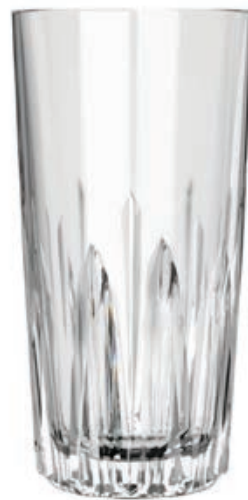
LP23HB12 DAZZLE HI BALL Capacity 350 ml TD 73 mm BD 61 mm MD 73 mm H 145 mm CBM 0.025