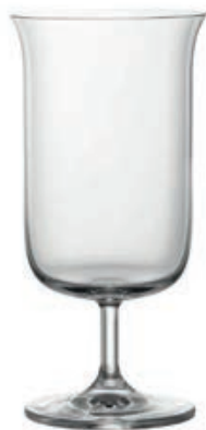
LS12DC12 DECO Capacity 340 ml. TD 77 mm FD 69 mm MD 77 mm H 160 mm CBM 0.034