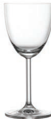
LS12NRO6 NICK & NORA Capacity 175 ml TD 70 mm FD 65 mm MD 70 mm H 168 mm CBM 0.031