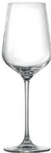
LSO4CB19 CABERNET Capacity 545 ml TD 67 mm FD 81 mm MD 90 mm H 263 mm CBM 0.067