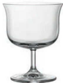
LS12LTO9 LOTUS Capacity 270 ml. TD 91 mm FD 69 mm MD 91 mm H 112 mm CBM 0.034