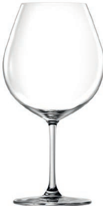
LSO1BG26 BURGUNDY Capacity 750 ml TD 72 mm FD 85 mm MD 110 mm H 212 mm CBM 0.081