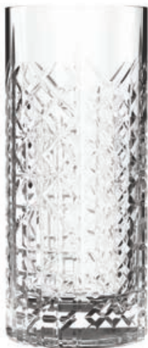
LP26HB12 KIN HI BALL Capacity 350 ml TD 67 mm BD 67 mm MD 67 mm H 155 mm CBM O.O23