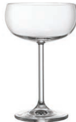
LS12SCO7 SAUCER Capacity 205 ml TD 90 mm FD 69 mm MD 95 mm H 133 mm CBM 0.041