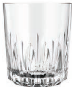
LP23RK10 DAZZLE ROCK Capacity 295 ml TD 83 mm BD 55 mm MD 83 mm H 90 mm CBM 0.021