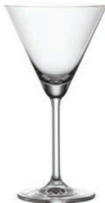
LS12MNO6 MARTINI Capacity 160 ml TD 87 mm FD 69 mm MD 87 mm H 173 mm CBM 0.048