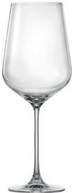
LSO4BD27 BORDEAUX Capacity 770 ml TD 75 mm FD 85 mm MD 102 mm H 275.5 mm CBM 0.089