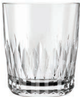
LP22DR12 RADIANT DOUBLE ROCK Capacity 350 ml TD 85 mm BD 73.5 mm MD 85 mm H 99 mm CBM 0.024