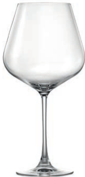
LSO4BG32 BURGUNDY Capacity 910 ml TD 76 mm FD 85 mm MD 122 mm H 252 mm CBM 0.114