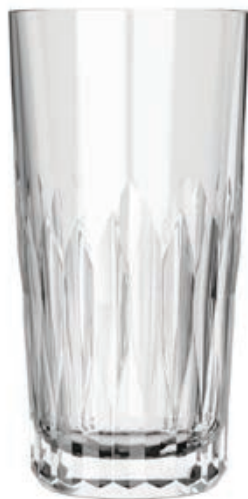
LP22HB12 RADIANT HI BALL Capacity 350 ml TD 73 mm BD 60 mm MD 73 mm H 145 mm CBM 0.025