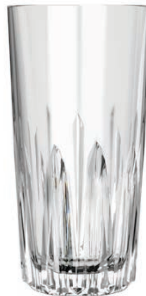
LP23LD15 DAZZLE LONG DRINK Capacity 430 ml TD 77 mm BD 50 mm MD 77 mm H 155 mm CBM 0.030