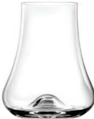
LT14WTO9 WHISKY TASTING Capacity 255 ml TD 50 mm BD 45 mm MD 82 mm H 96 mm CBM 0.023