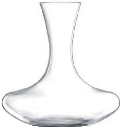
4GB01G0013 BLISS DECANTER (S) Capacity 750 ml TD 73 mm BD 100 mm MD 215 mm H 219 mm CBM 0.079