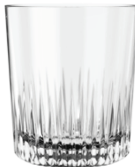
LP24DR12 GLEAM DOUBLE ROCK Capacity 350 ml TD 85 mm BD 74 mm MD 85 mm H 99 mm CBM 0.024