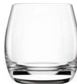
LT16DR13 DOUBLE ROCK Capacity 370 ml TD 70 mm BD 50 mm MD 88 mm H 92 mm CBM 0.025