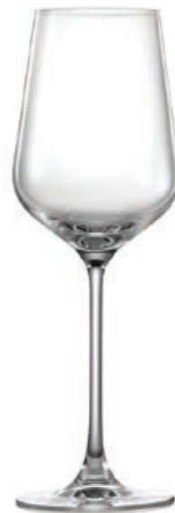
LSO4CD15 CHARDONNAY Capacity 425 ml TD 62 mm FD 81 mm MD 83 mm H 247.5 mm CBM 0.055